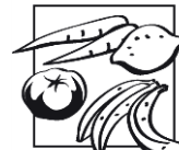
Fruit, vegetable and frozen product