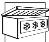
Freezer (subject to individual trials)